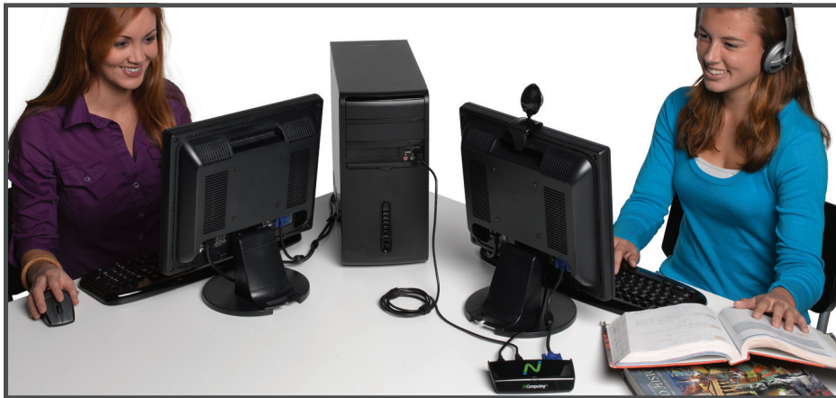
The U170 is ideal for classrooms, public access, small business, digital signage, and home use.

Desktop virtualization does not have to be complex. Or expensive. Unlike other desktop virtualization solutions, NComputing does not need expensive and complicated servers and infrastructure. In fact, vSpace was designed to efficiently share the normally wasted CPU cycles in standard low-cost PCs. In an NComputing solution, vSpace creates multiple virtual workspaces in one physical computer, and then the additional users connect their monitors, keyboards, and mice, through a simple access device. With the U170, connecting the access device to the shared computer couldn't be easier: just snap them together with the included USB cable.